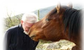
"Saving America's Horses is a must see film!" - Michael Blake

Advanced ticketing for the event is now available on line through the festival website and seats are expected to go quickly.